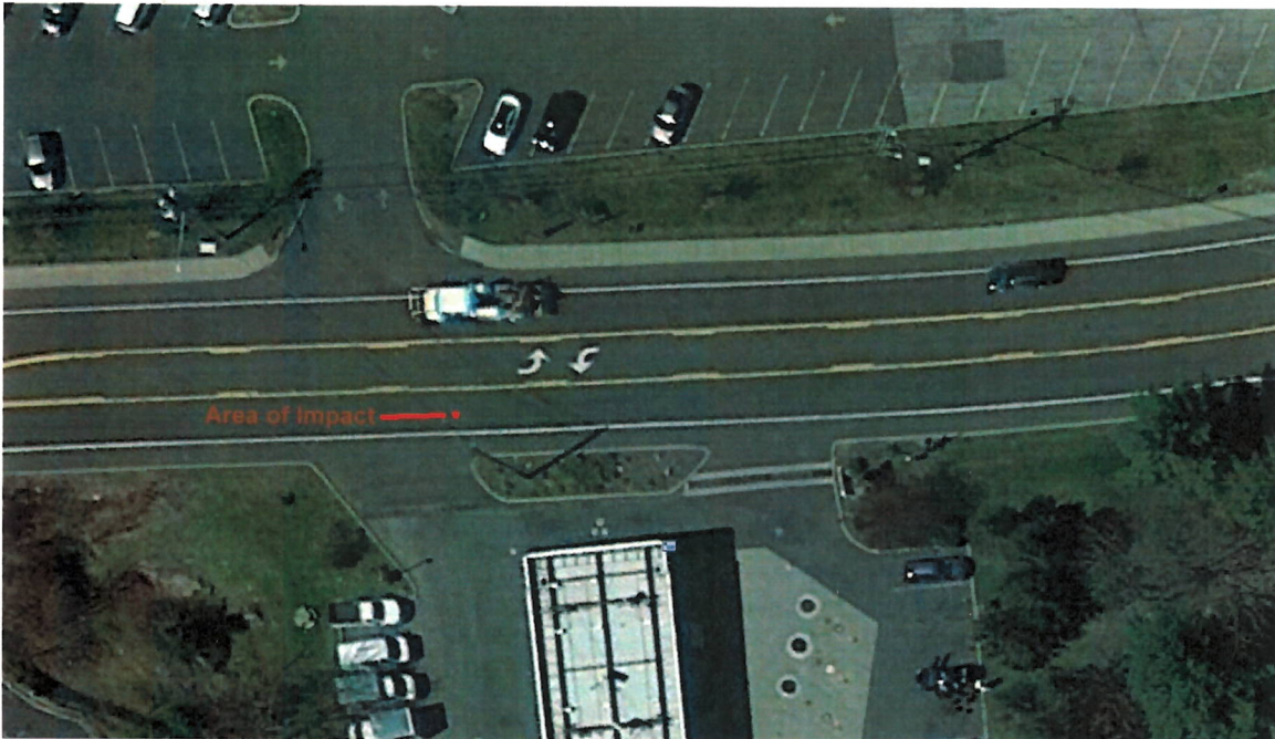
Google Earth aerial view of State Route 202 highlighting area of impact

Trooper Markle photographed the scene documenting its condition at the time of the investigation. Trooper Markle and I forensically mapped the scene of the collision utilizing a Leica TS02 Electronic Total Work Station (Serial #1327259).