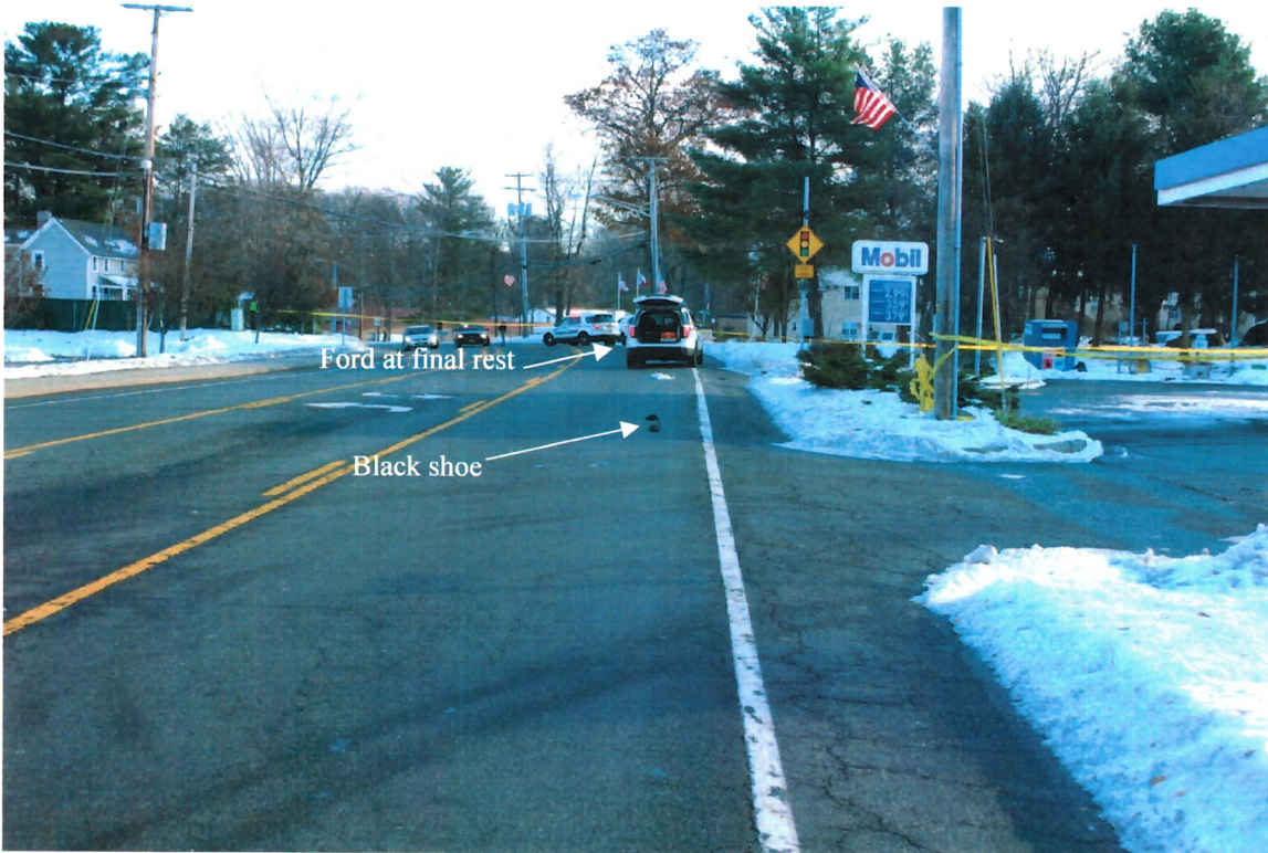
State Route 202 facing eastbound

primarily within the eastbound lane. The location and positioning of this evidence further indicates the pedestrian was within the eastbound lane when he was struck by the Ford.