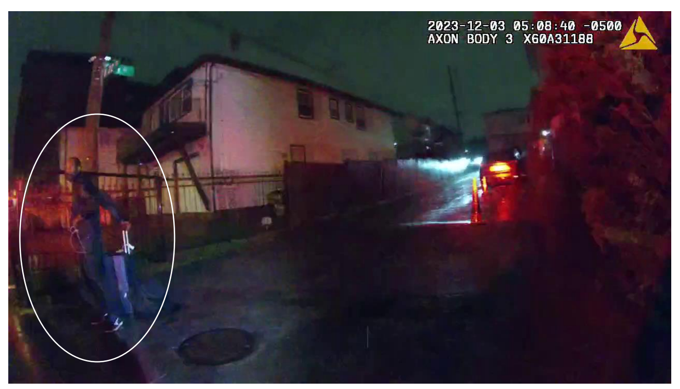
Figure 4. Still image from Officer Decio's BWC at 05:08:40 showing Mr. Gordon as the officers approached him.