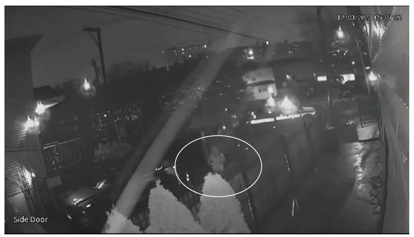
Figure 2. Still image from a home security camera on Beach 22nd Street showing the 911 caller running toward the ambulance.