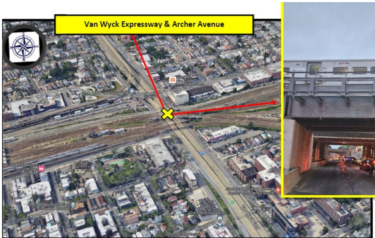
Map and photo generated by the NYPD's Force Investigation Division showing the collision site.